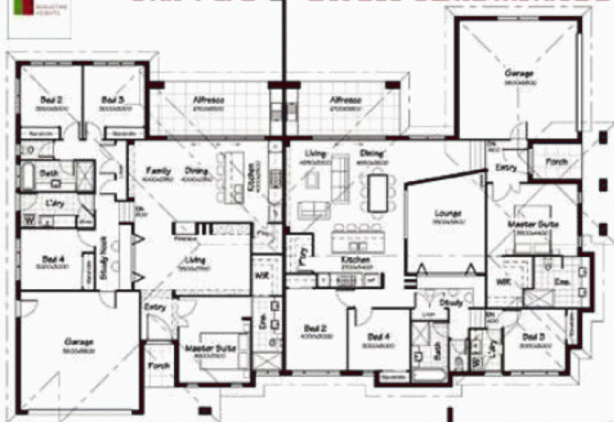
Ground Floor 1:100