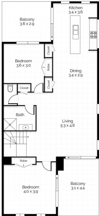
Floor Plan Upper Floor