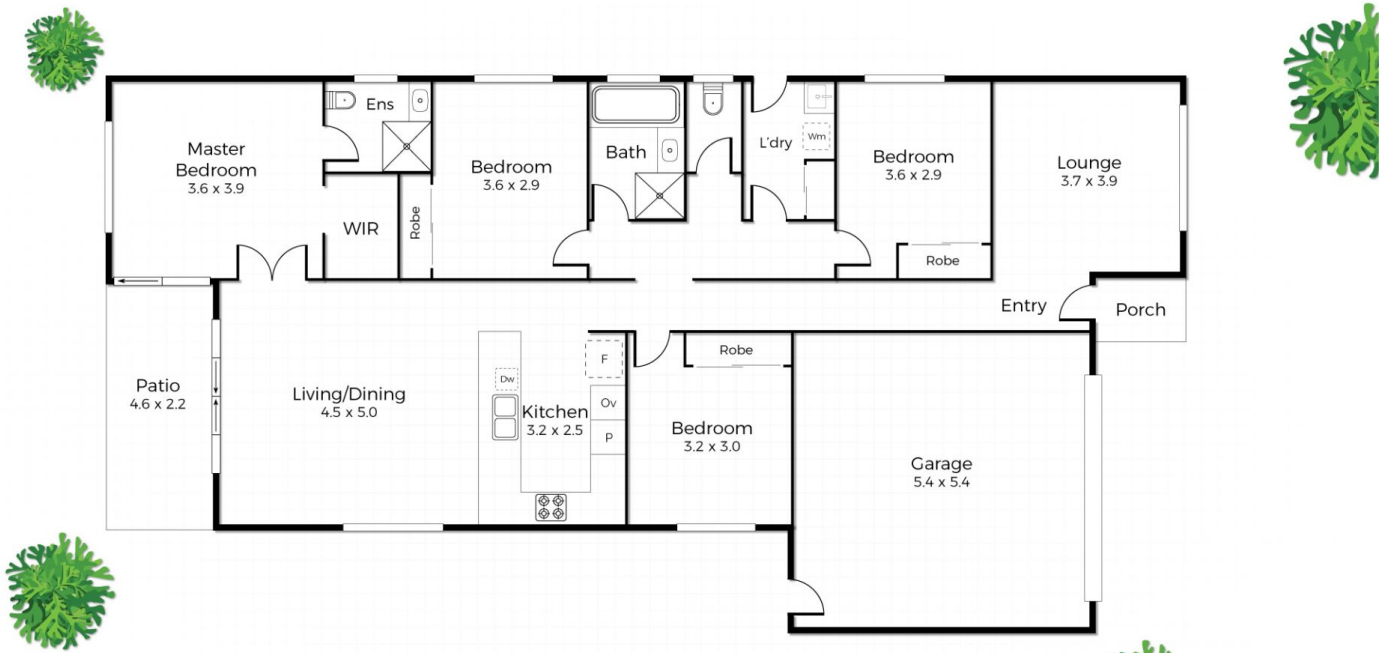
Floor Plan Ground Floor