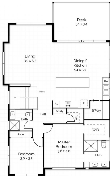
Floor Plan Upper Floor