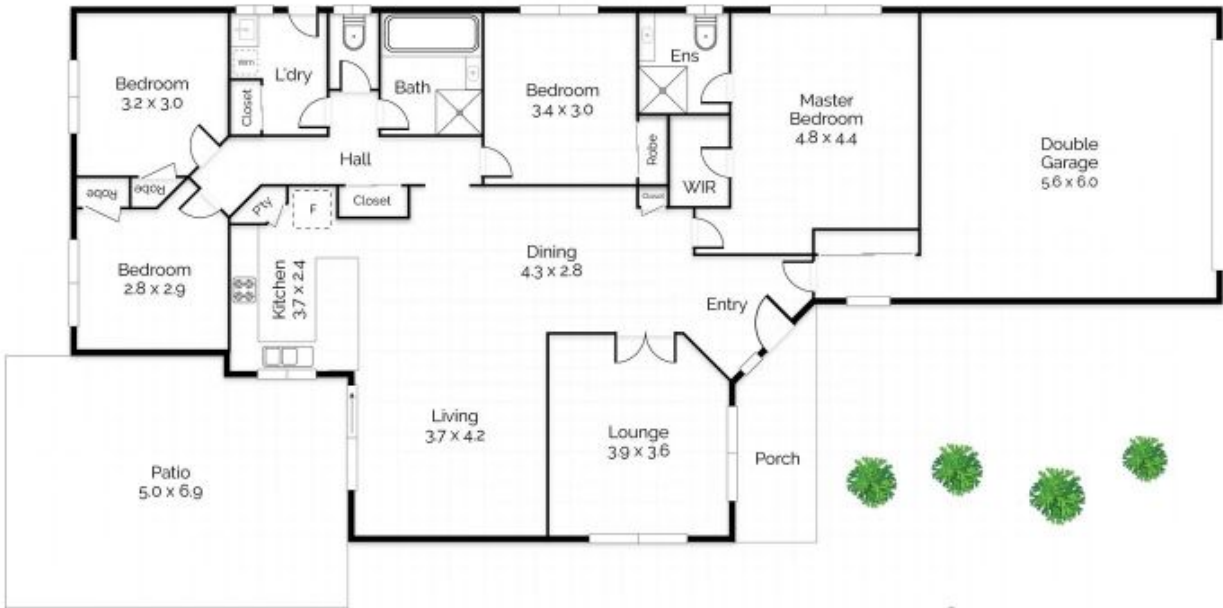
Floor Plan Ground Floor