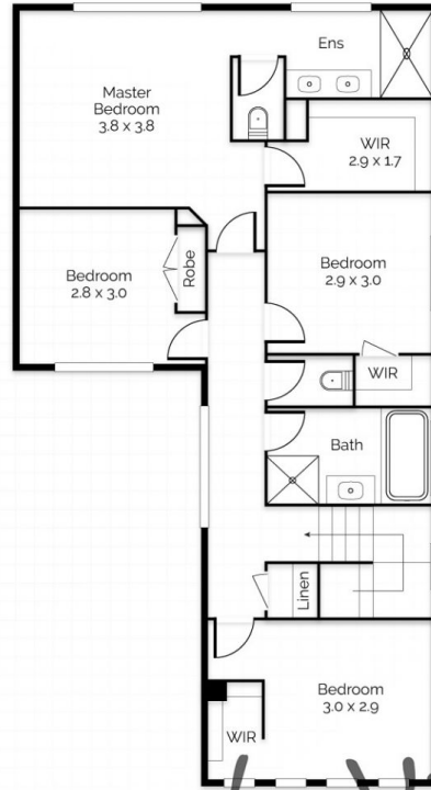
Floor Plan Upper Floor