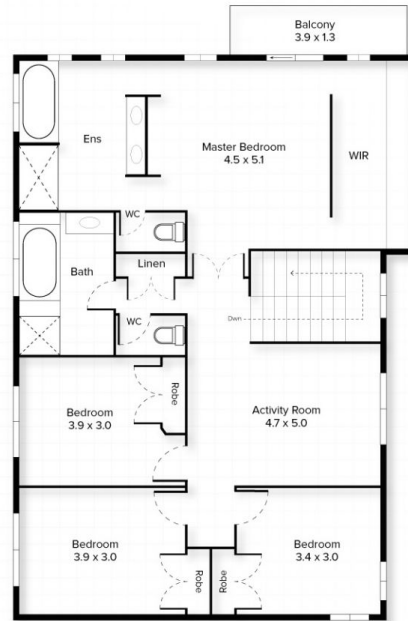
Floor Plan Upper Floor

Conditions of use: All floor plan measurements, positions and angles are approximate and for illustrative purposes only. Hausable makes no guarantee as to the accuracy of any measurements, symbols or textures as the intent of this floor plan is to indicate the approximate layout of the property only, and must not be relied upon for any other purpose, whatsoever. While every attempt at accuracy is made, potential buyers must seek their own independent professional measurements to determine the homes suitability before purchase. Hausable accepts no responsibility or liability for any loss, however arising, from the use of this floorplan. This floor plan must not be reused, or resold for any reason without prior written consent from Hausable Pty Ltd.