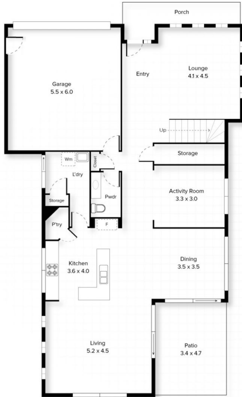
Floor Plan Ground Floor