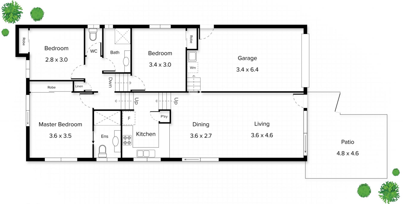
Floor Plan Ground Floor

Conditions of use: All floor plan measurements, positions and angles are approximate and for illustrative purposes only. Hausable makes no guarantee as to the accuracy of any measurements, symbols or textures as the intent of this floor plan is to indicate the approximate layout of the property only, and must not be relied upon for any other purpose, whatsoever. While every attempt at accuracy is made, potential buyers must seek their own independent professional measurements to determine the homes suitability before purchase. Hausable accepts no responsibility or liability for any loss, however arising, from the use of this floorplan. This floor plan must not be reused, or resold for any reason without prior written consent from Hausable Pty Ltd.