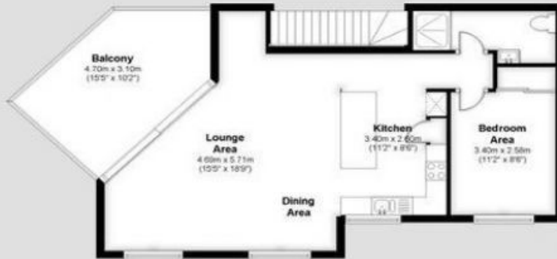
First Floor Approx. 54.5 sq. metres (587.1 sq. feet)